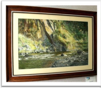
Eroding Cliffs