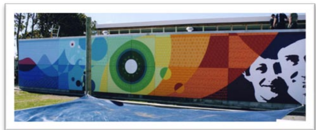
2 nd Place – School Mural 2009, Coastal Taranaki School

Beautify your town or neighbourhood and create an artistic landmark! Resene is running a mural competition, giving you the chance to win over $5000 worth of prizes. There are four classes to enter: best school mural, best community mural, best professional mural and best mural design.