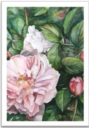
Watercolour by Jayne Sarsfield