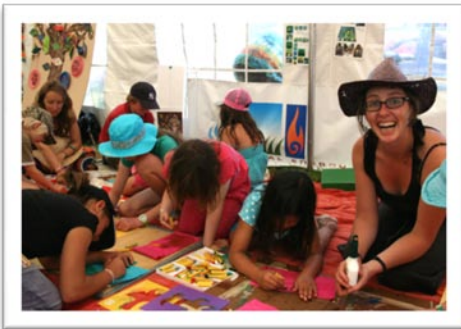
Facilitating art activities at the Kidzone, Parihaka Peace Festival, January 2010