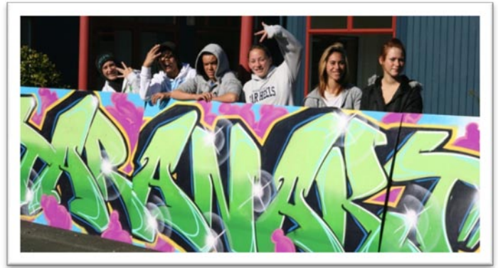
A Creative Communities funded workshop - Patea youth display graffiti artwork created in Youthweek, May 2010